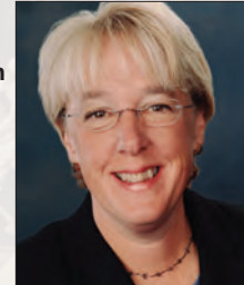
Patty Murray (D-WA) born 1950, Senate since 1993