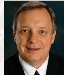
Dick Durbin (D-IL) born 1944, Senate since 1997