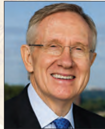
Harry Reid (D-NV) born 1939, Senate since 1987