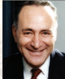
Charles E. Schumer (D-NY) born 1950, Senate since 1999