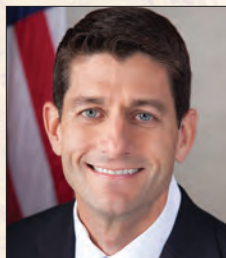
Speaker of the House Paul Ryan (R-WI) born 1970, House since 1999