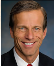
John Thune (R-SD) born 1961, Senate since 2005