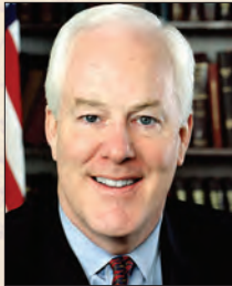
John Cornyn (R-TX) born 1952, Senate since 2002