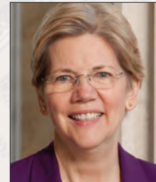
Elizabeth Warren (D-MA) born 1949, Senate since 2013