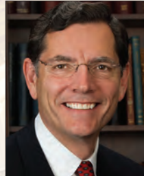
John Barrasso (R-WY) born 1952, Senate since 2007