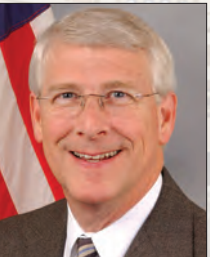
Roger Wicker (R-MS) born 1951, Senate since 2007