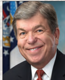
Roy Blunt (R-MO) born 1950, Senate since 2011