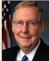
Mitch McConnell (R-KY) born 1942, Senate since 1985