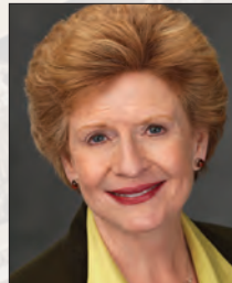
Debbie Stabenow (D-MI) born 1950, Senate since 2001