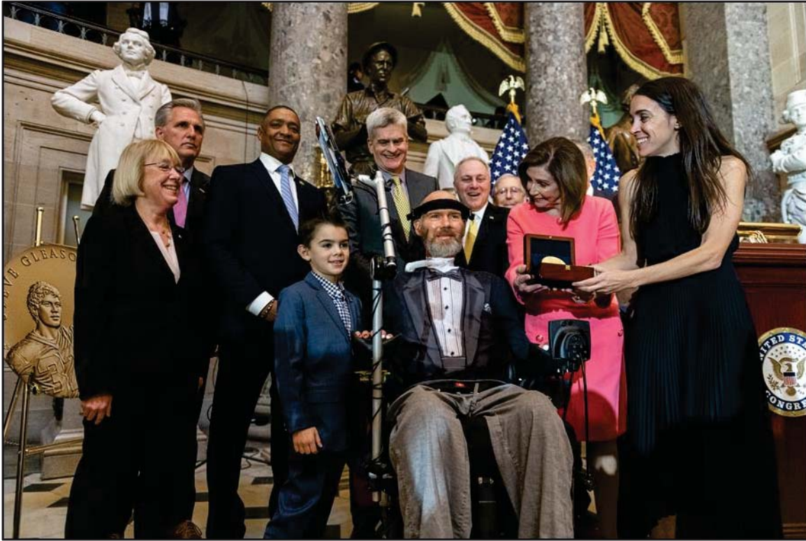
Figure 2. Congressional Gold Medal Presentation Ceremony for Stephen Gleason January 15, 2020