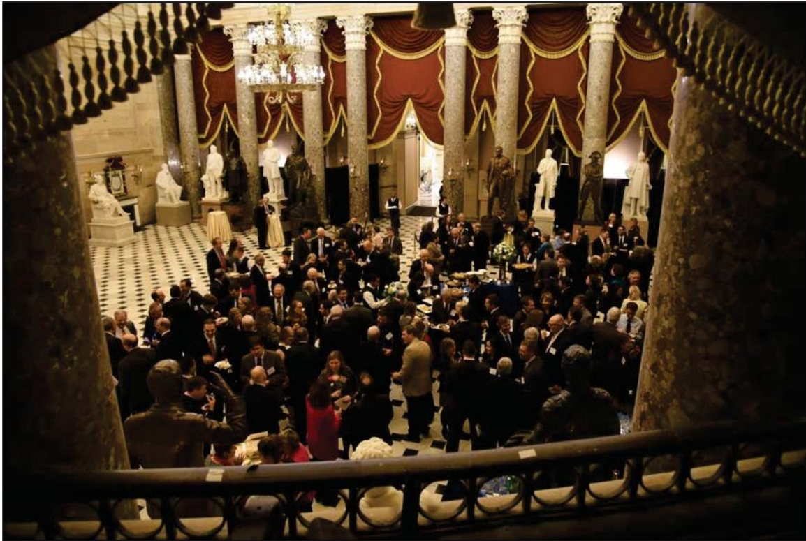
Figure 1. United States Capitol Historical Society Reception to Honor the 90 th Anniversary of the Joint Committee on Taxation February 24, 2016