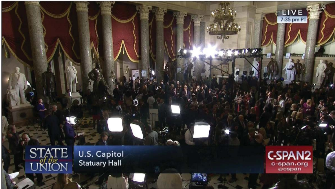
Figure 3. Media Interviews for State of the Union Address in National Statuary Hall January 30, 2018