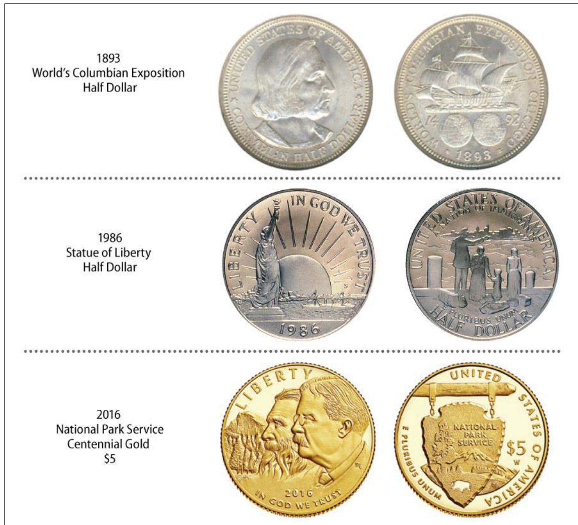
Figure 2. Examples of Commemorative Coin Designs