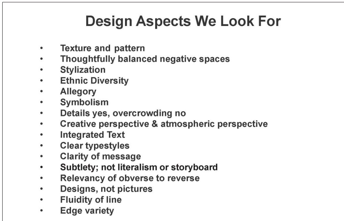
Figure 1. Citizens Coinage Advisory Committee Design Elements

Source: Citizens Coinage Advisory Committee, “Design Aspects We Look For,” How to Make Friends and Influence the Committee (aka How to Get Picked) , May 20, 2014, p. 2, at http://ccac.gov/media/aboutUs/specialReports/Medallie-Design-Elements.pdf .